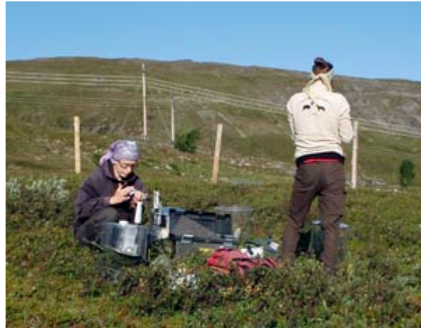
Analyzing net ecosystem carbon exchange in the field.

At present, tundra ecosystems store large quantities of soil carbon that has been accumulating to the soil over centuries and millennia. It is currently predicted that increasing temperatures by global change will enhance decomposition of these large soil carbon stocks. As a result, tundra soils may start contributing to the increase in atmospheric carbon dioxide. In this project, we experimentally simulate effects of global change with specifically designed warming chambers (ITEX standard open top chambers) in a sub-